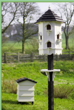
The Scout hut had a charming dovecot full of doves.

In December Carol and I attended the compulsory